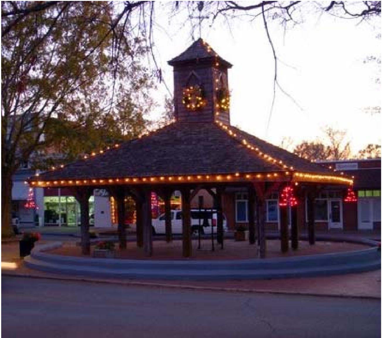
Our Market House Decked Out for the Holidays