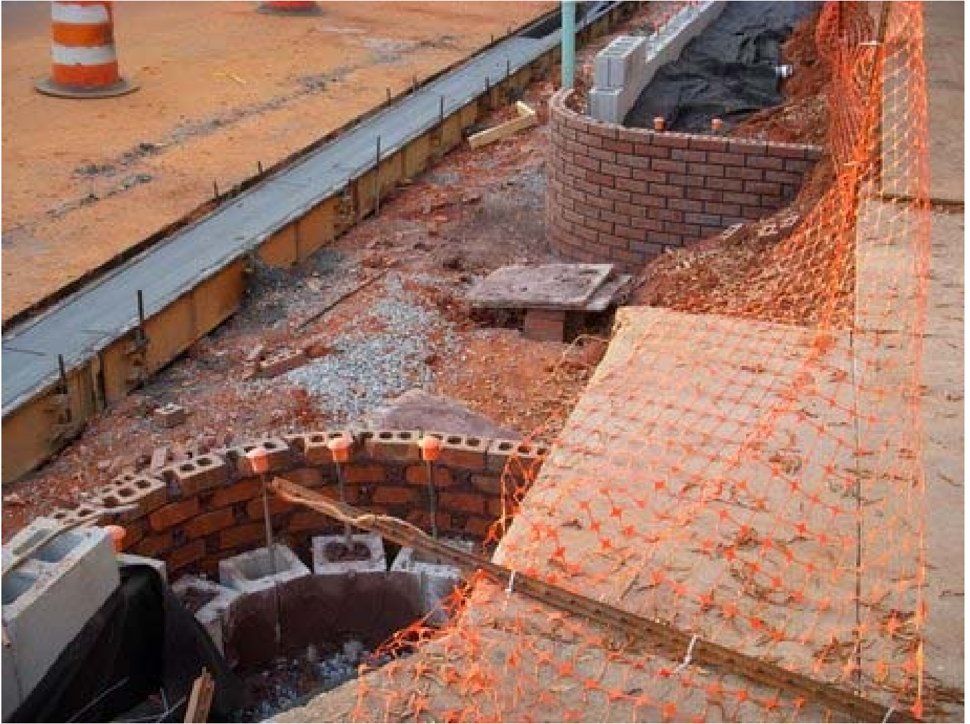
Streetscaping Moves Forward – New Contours Appear amidst the Debris of Demolition