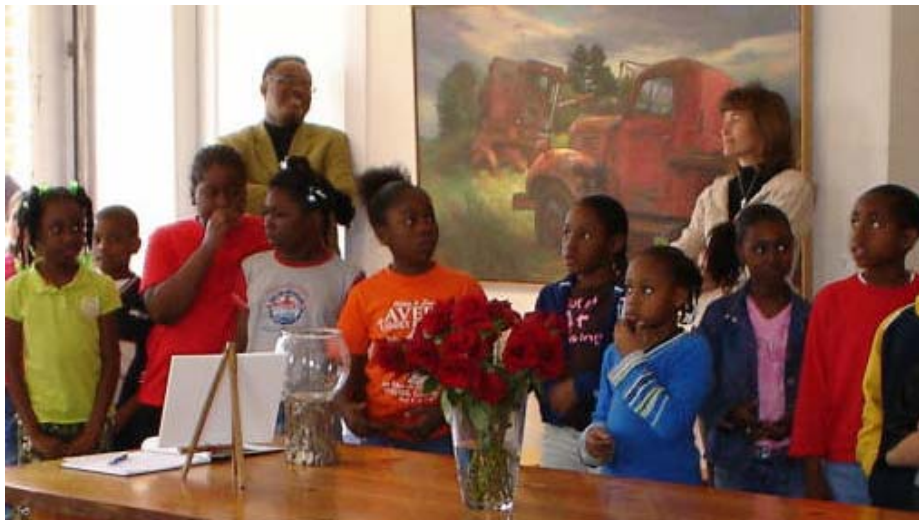
LOUISVILLE ACADEMY STUDENTS ENJOY GALLERY DAYS VISIT

TO HELP THE STUDENTS DEVELOP AN UNDERSTANDING OF BASIC ARTISTIC CONCEPTS, SUCH AS THE DISTINCTION BETWEEN REPRESENTATIONAL AND ABSTRACT ART. THROUGH THIS PROGRAM, OVER TIME THE GALLERY HAS BECOME A FAMILIAR COMMUNITY POINT OF REFERENCE FOR MANY CHILDREN WHO MIGHT NOT OTHERWISE EVER HAVE VISITED THIS OR ANY OTHER ART GALLERY AS PART OF THEIR ELEMENTARY EDUCATION. RECENTLY, GALLERY DAYS HAS BEEN EXPANDED TO INCLUDE THE LIFE PROGRAM FOR GIFTED STUDENTS COUNTYWIDE, AND THE GALLERY HAS A GOAL TO REACH OUT TO WRENS AND CARVER ELEMENTARY SCHOOLS IN THE COMING YEAR.