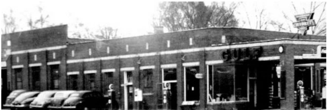
HENDERSON CHEVROLET CIRCA 1935, ABOVE, AND 1950, BELOW.