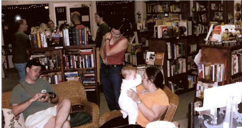
Louisvillians gather for Harry Potter Release Celebration at The Bookworm