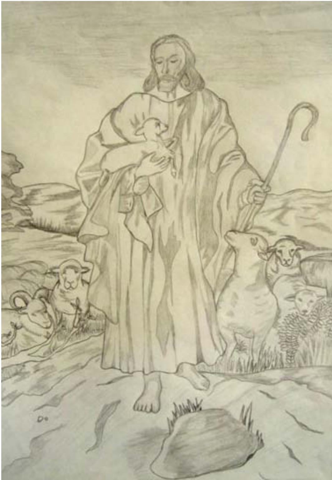
THE GOOD SHEPHERD AS DEPICTED BY JCHS AP ART STUDENT KELVIN VASQUEZ