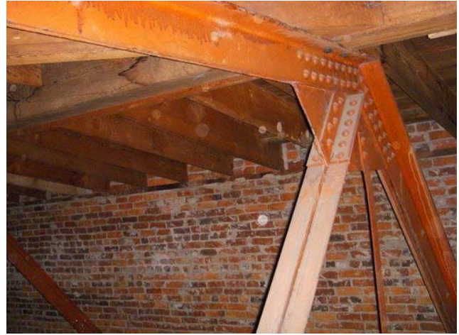
STEEL STRUTS AND HEART PINE BEAMS IN BELFRY