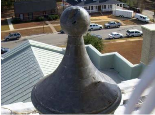
STRIPPED AND PITTED FINIAL