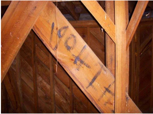
"1904" ON HEART PINE BEAM