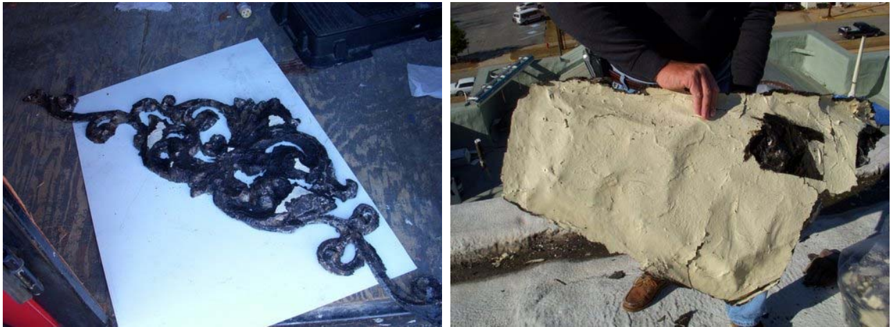
FOLIATE ORNAMENT MIDWAY IN RESTORATION AND, BEFORE, ENCRUSTED IN TAR AND PAINT