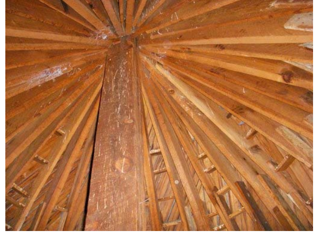
HEART PINE BEAM, JOISTS UNDER DOME

CONCEALED BEHIND THE LOUVERED PANELS, AMID EXPOSED HEART PINE BEAMS AND STEEL STRUTS, HANGS A FORMIDABLE BRONZE BELL WITH ITS STRIKER POISED ABOVE. SCRAWLED ON ONE HEART PINE TIMBER BEAM IS THE YEAR "1904," DATE OF THE CONSTRUCTION OF THE COURTHOUSE. ANOTHER BEARS THE DATE 1913, AND WE GUESSED WHAT MIGHT BE THE SIGNIFICANCE OF THAT DATE.