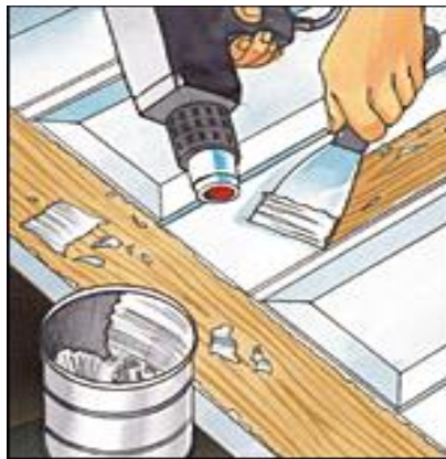
HEAT GUNS CAN BE DANGEROUS!